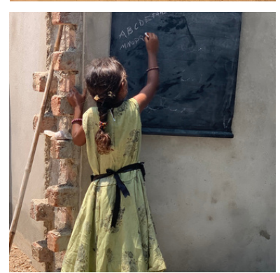
From top to bottom: Children attend school on the mat, the multi-purpose centre building site, a girl learning to write the alphabet